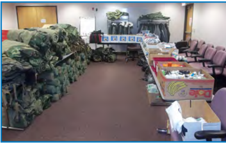
Some of the supplies available for the veterans.