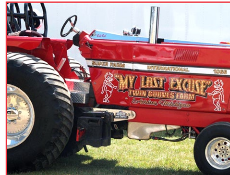
One of the entries at the event.

in the community allows the organization to actively engage with the public, while also inviting others to offer their services and experiences. By building and maintaining these relationships, VAF can better assist those who require it. We made valuable contacts with individuals and groups looking to donate time and/or items for the Veterans in our programs. There were many who stopped by to ask questions about the program and thank us for providing the services we do for the Veterans who are in need. All the VAF staff were involved over the four-day event.