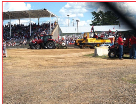
The Tractor Pull was held at Tomah’s Recreation Park.

The city of Tomah, Wisconsin hosted the 37th Annual Budweiser Dairyland Super National Truck and Tractor Pull Thursday, June 21st through Sunday, June 24th and the Veterans Assistance Foundation (VAF) was in attendance. Tucked inside the Gold Exhibition Hall, VAF staff constructed a small booth to offer information, collect donations and enjoy the roar of mechanical feats of strength outside.